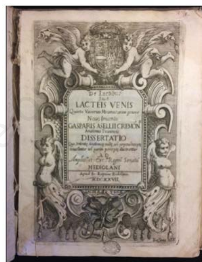
Figure 3. Quarta Vasorum Mesaraicorum genere - Novo Invento - 1627.