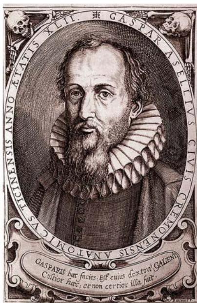
Figure 2. Gaspare Aselli.