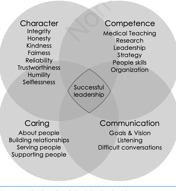
Figure 1. The four Cs of physician leadership.

Despite finding evidence to support the five major leadership theories, participants demonstrated that leadership in academic medicine crosses those five major theories, indicating none is comprehensive as a model of leadership. We repeated an inductive content analysis to identify the most prominent, encompassing leadership concepts that would inform a multidimensional perspective on leadership. This analysis revealed four principal domains of successful leadership: character, competence, caring, and communication. These four domains provide a comprehensive model for successful leadership in academic medicine (Figure 1).