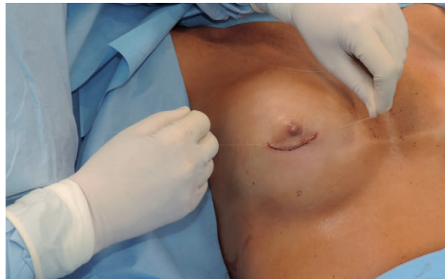
Figure 2. The catheter is extracted and the intradermal suture is pulled to close the incision.