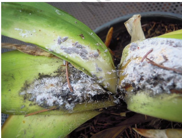
Figure 2. A colony of Vryburgia amarillidis on the basal leaves of potted Agapanthus sp.