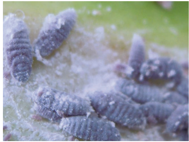
Figure 3. A colony of live female Vryburgia amarillidis .

The populations found in Sicily were morphologically closer to the populations from California (McKenzie, 1967) than to those from New Zealand (Cox, 1987). The Sicilian populations have more numerous trilocular pores than those from California and New Zealand. Other differences in the number and distribution of multilocular disc pores and ventral oral rim tubular ducts fall in the range of expected variability for this species.