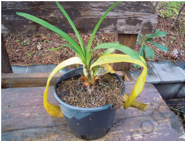
Figure 1. A potted African lily, Agapanthus sp.