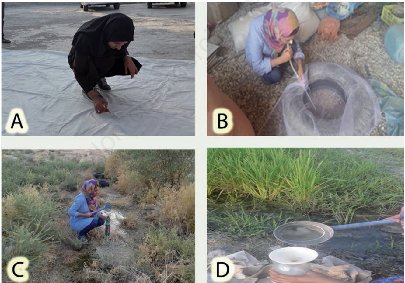
Figure 2. Using of different sampling techniques for collecting of different life stages of mosquitoes in selected sites of Qir and Karzin County, Fars Province during 2017-18. A: Collecting with the adult stage of mosquitoes by total catch method. B: Collecting with the adult stage of mosquitoes using waste tires that filled with water and then covered by a net as a suitable resting/ovipositing place. C: Larval sampling by a standard dipper from a natural breeding habitat. D: Larval sampling from a rice field using a standard dipper.

During the study on the larval breeding places of the collected specimens in the studied areas, it was found that most of the larval habitats were temporary and stagnant. Among the larval habitats, the most collected samples belonged to the species of Cx. laticinctus . This species was collected from sunny, semi-shady and vege-