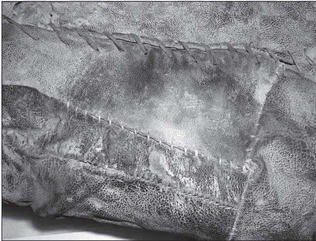
Fig. 2 - Mummy NEC-I. Sewing types.