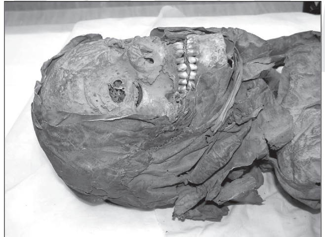
Fig. 4 - Bundle and strips of the head and the neck.