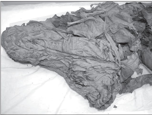
Fig. 3 - Lower limbs.

of the individual. Different strips were used to fix the bundle.