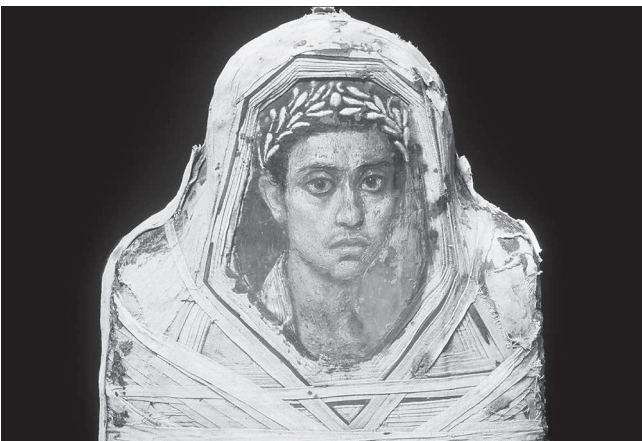
Fig. 3 - The encaustic painted wood panel portrait juxtaposed with the essentially identical portrait reconstructed from the CAT scan images.

portrait, well within the limitations of the technique used (Fig. 3). Fortunately we had the mummy and the portrait together, not a common happenstance, so we are able to state with complete confidence that in the case of this individual the painted panel is indeed a true portrait. The dramatic findings in Esmin (MMA 86.1.51) highlight the advantages of the "virtual unwrapping" that can be