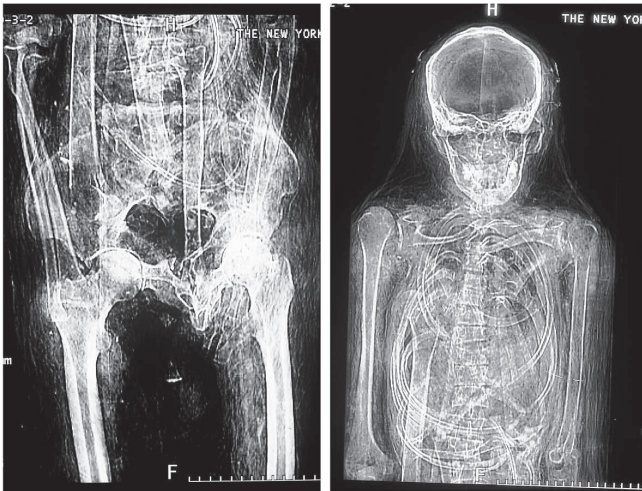
Fig. 2 - Nesi Amun's fractured left humerus, with callus, and the fractured pelvis with extraneous papyrus rods in the spinal region.