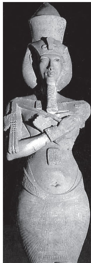
Fig. 2 - Statue of Akhenaten showing a feminine morphology and an acromegaloid facies (Egyptian Museum, Cairo).

We haven't yet identified the mummy of Amenhotep IV or Akhenaten, the "Heretic Pharaoh" who is usually represented with an acromegaloid facies and a female-like appearance (Fig. 2).