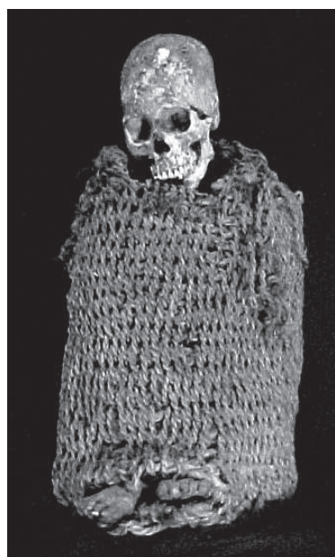
Fig. 1 - Aymara mummy, frontal view.

The body is from a Chulpa. It is surrounded by a fiber bundle coiled around the deceased, leaving apparent the feet and face. The head is now uncovered as a consequence of the destruction of the upper part of the basketry (Fig. 1). In general the preservation of this mummy is good. Insect damage can be seen at the scalp, where the skin is partially destroyed, contrary to the rest of the body, where the macroscopic tissue integrity is maintained.