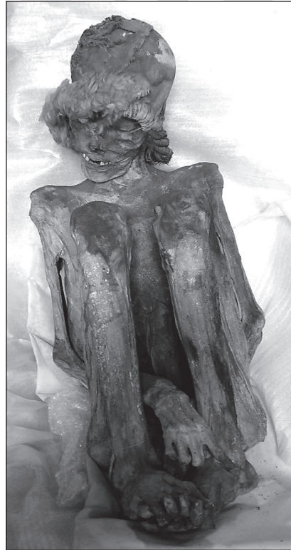
Fig. 3 - Atacameño mummy, frontal side view.

A few osteological observations were made. The vertical occipital flattening of the head suggests intentional skull deformation (Buikstra & Ubelaker, 1994) that is also