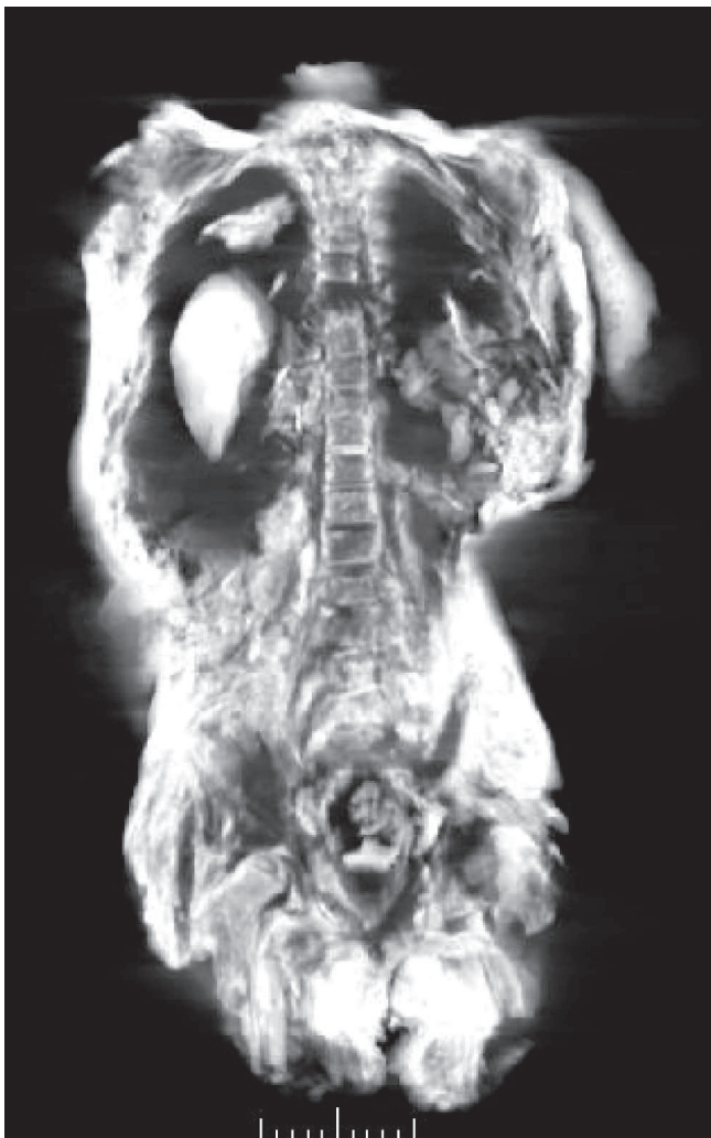
Fig. 2 - This bi-dimensional image of the trunk obtained by tomography is a frontal view. The vertebrae are in the center of the image, and one may distinguish easily the thoracic and lumbar parts of the spine with the absence of the body of the 6th thoracic vertebra.

presence of the 6 th thoracic vertebra (T6) at the top of the right thoracic cavity! The only one explanation that could be given to such a post-mortem anomaly is the brutality of the exhumation (and funeral games...).