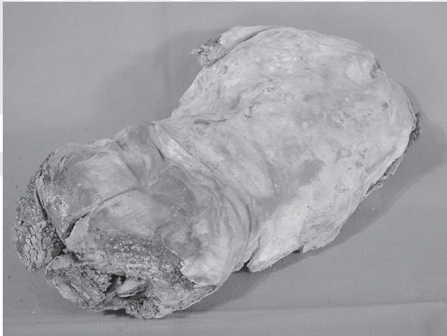
Fig. 1 - On this view of the back-face of the trunk, after cleaning, one may observe: brown zones of exposed skin; other zones covered by a white coat made of chalky and lead, with origin comes from the chemical particularities of percolation waters and deposited at the surface of the body.