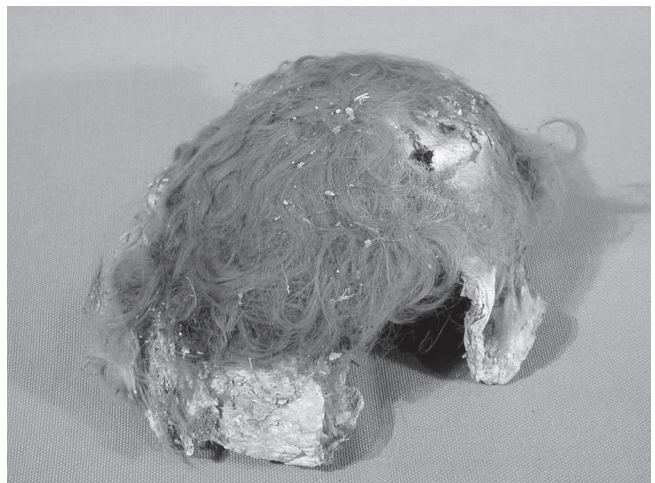
Fig. 4 - The hairs and, more precisely, the determination of the natural or not red colour engaged us to make complementary analysis. The exam under binocular lens showed an homogeneous coloration, sign of a probable natural colour.

The absence of any superficial lesion that could explain the cause of death gave us some good reasons to perform some histological examinations. The microscopic visualization of cranial bone showed the presence of red blood cells and some well conserved lymphocytes (Fig. 3). Observed under polarized light, collagen fibers showed no anomaly. Their regular disposition indicated a normal and physiological growth. A part of the rectal cavity was studied and showed the preservation of all four digestive levels.