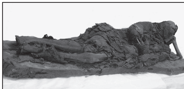
Fig. 1 - Picture of “The Mummy in the dress”.

The mummy wears a pleated dress over its bandages; the body is wrapped on the upper part while there is no