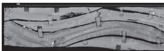
Fig. 3 - The wooden coffin.

The observable part of the dress indicates that it is similar to approximately thirty long-sleeved linen tunics with horizontal pleating housed in several museums around the world. Three of them belong to the Egyptian Museum of Turin: one is from Gebelein and dates to the 6 th Dynasty (Inv. I4087) (Hall and Pedrini, 1984), while the other two come from Assiut and date to the end of the Old Kingdom – beginning of the First Intermediate Period (Suppl. 7932) (Pedrini, 1989).