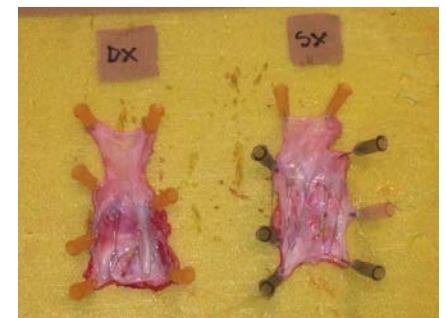
Figure 2. Porcine internal jugular veins implanted with Petalo CVS for six months. The distal metal bars of the device are enveloped in the intimal surface and sometimes the central part is also surrounded. There are not fibrosis and neo-vascularized tissue. 40