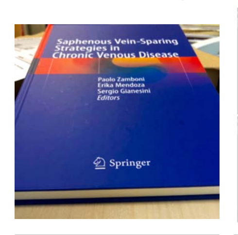
Figure 1. The cover of the new textbook.