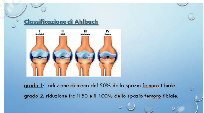
Figure 2. Classification of gonarthrosic pathology according to Ahlback.