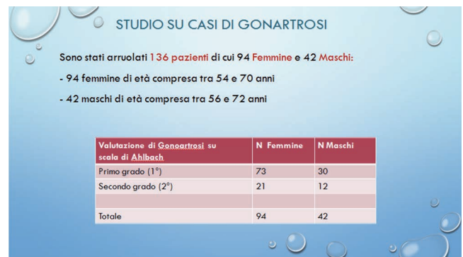
Figure 3. Number and categories of patients enrolled in the trial.