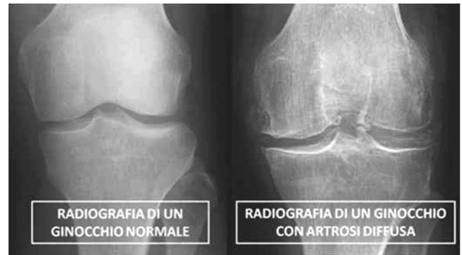
Figure 1. Radiological evidence of a normal and an arthrosic knee.

The protocol envisages an infiltration per week for five weeks