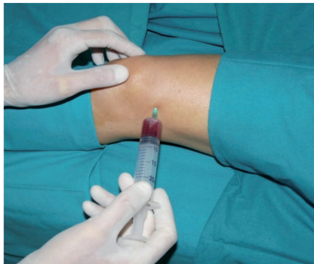
Figure 4. Example of autologous ozonized blood infiltration mode.

In all patients treated, both male and female and belonging to groups with first and second degree gonarthrosis on Ahlback's scale, all parameters assessed via the Womac index saw significant improvement after treatment with O 2 /O 3 (Figure 5).