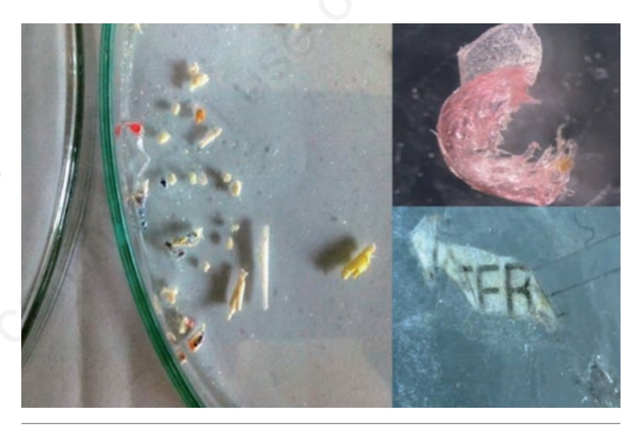
Figure 2. Plastic fragments detected in grated bread.