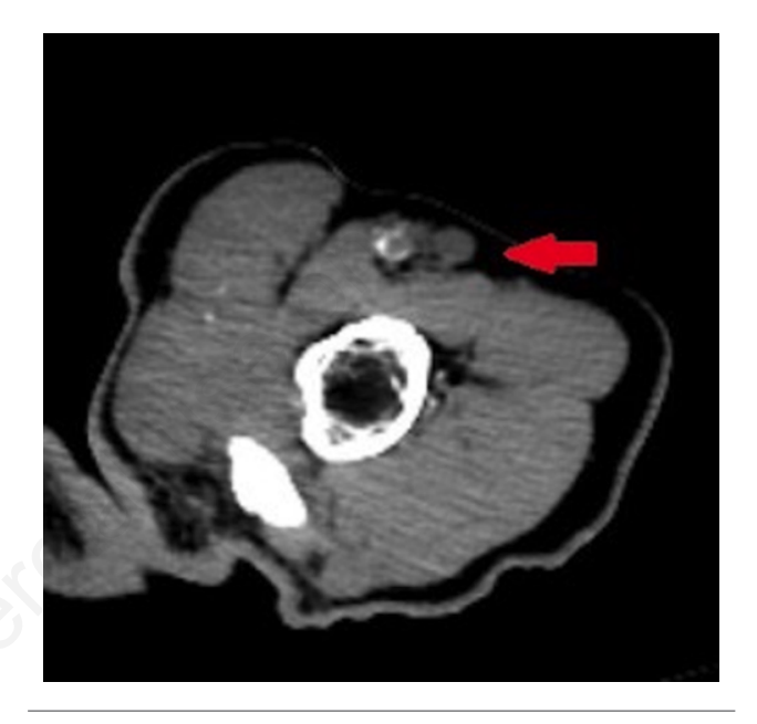
Figure 2. Upper limb angiogram demonstrating embolus in brachial artery

The patient was managed on an acute respiratory ward and discharged home on day 5 with rivaroxaban for long term anticoagulation. He was followed up with the respiratory team as an outpatient. An echocardiogram performed two months after discharge highlighted a shunt across the atrial septum (Figure 3).