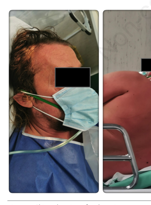
Figure 2. Skin coloration of male patient.

Is it possible to think of CO poisoning for all patients with an acute ischemic complaint evaluated in an ED? All authors agree that venous CO levels are as diagnostic as arterial ones, but this could lead to an increase in sanitary costs without a real impact on health results. Probably the use of oxygen and carbon monoxide oximeter could make diagnosis of ED poisoning easier, but this is useless in case of chronic, severe exposure with normal or quite to normal CO blood levels.