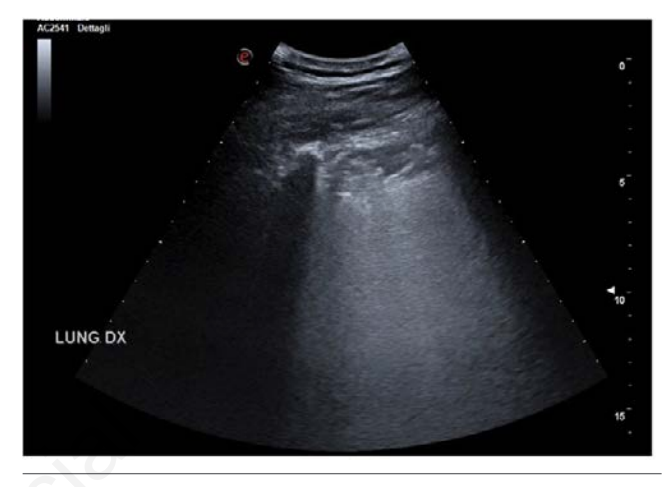
Figure 1. Lung ultrasound on conventional oxygen therapy: bilateral subpleural consolidations, with some lung fields characterized by coalescent B lines as for "white lung".

This process of progressive alveolar de-aeration finds a reverse confirmation through to the use of ventilation methods. In our case, a CPAP therapy with prone positioning was used, that allowed the re-ventilation of atelectasis areas through the application of positive pressure.<sup>17</sup> In pneumonia, CPAP was used mainly for non-hypercapnic acute respiratory failure. 18-20 On ultrasound, the process of re-ventilation is evidenced by the progressive disappearance of the consolidation areas, in favor of an air interface, with a gradual reduction in the number of B lines, up to a normal A pattern. Therefore, lung ultrasound allows to monitor the effect