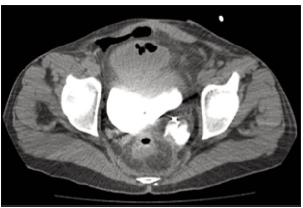
Figure 1. UroCT at the time of diagnosis of the ureteral injury. Contrast leakage from the left pelvic ureter.

In the ascending pyelography, complete extravasation of contrast outside the urinary tract was found about 4 cm above the bladder. In addition, it was not possible to raise the guidewire through the ureter. Ureterorenoscopy with a 9.5F semirigid instrument ( Storz ®) was decided, checking for a disheveled area and complete solution of continuity of the ureter, without reaching the proximal end of the ureter with any guidewire. At that time, given the history of multiple abdominal surgeries, the most