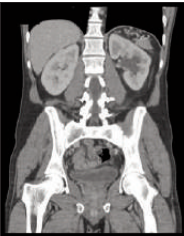
Figure 3. CT and renogram four months after the realignment. They showed minimal patent pathway in the left kidney and absence of obstruction, with a differential function for the affected kidney of 46%.