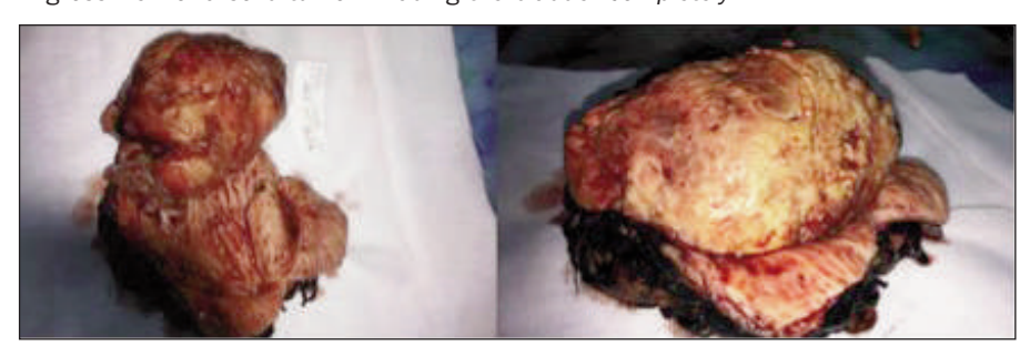
Figure 2. A gross view of a solid tumor invading the bladder completely.