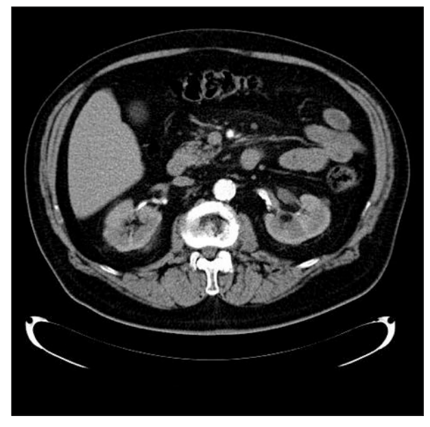
No conflict of interest declared.