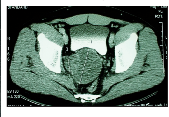
Figure 2. CT scan of the pelvis showing two rounded cysts.