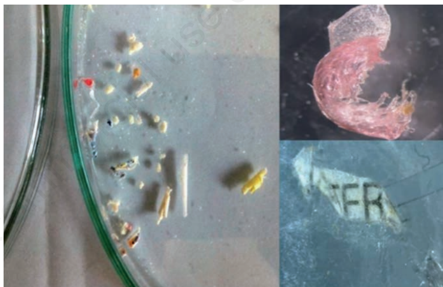
Figure 2. Plastic fragments detected in grated bread.