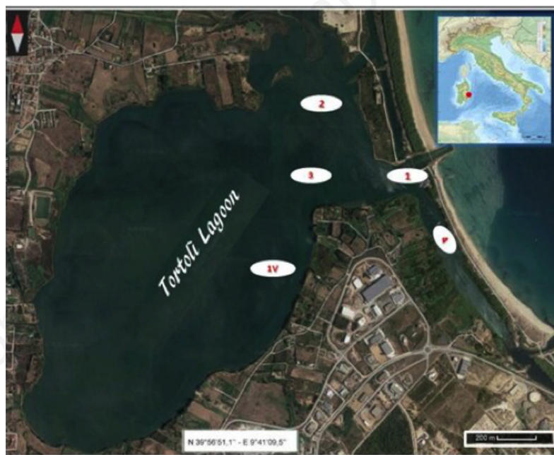
Figure 1. Study area and breeding points of the different species of molluscs.

three samples (Table 1). In fact, in most samples with the presence of PTXs, it was a minority component in comparison to the OA toxin group (Figure 2); on average, it represented 26% of the toxins detected in the sample, with a maximum of 41% and a minimum of 10%. The presence of PTXs was always recorded in oyster and clam samples; in contrast, it was never detected in mussels. Every time the OA and PTXs toxin groups were found in molluscs, Dinophysis species were reported in the seawater, even days or weeks before the identification of toxin accumulation. Dinophysis species mostly present were D. acuminata , and to a lesser extent, D. sacculus Stein. The average water temperature recorded when PTXs were present was 12°C and the average pH value was 7.3. Data on water temperature and pH are pre-