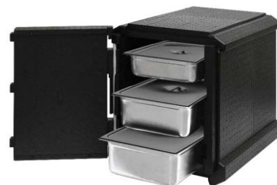
Figure 1. Isothermal container in expanded polypropylene (Polibox Smart Heater®).

Three steel gastronorms GN 1/1, 10 cm deep, completely filled with food and piled with their lids, were introduced in the PX SH in the following way: a first dish in the medium position, a second dish in the highest position and a side dish in the lowest position. The container loading was carried out in about 1.5 minutes. After loading, the container display reported a temperature loss of about 2-3°C. The temperatures were measured by means of three certified data loggers (Testo Saveris, model: T2D, calibrated by Certified Calibration Laboratories), positioned in the geometric centre of the gastronorms (immersed in the food). The container remained attached to the mains for 1 hour. It was then disconnected and moved by a vehicle suitable for the food transport to the microbiology and food inspection laboratory (VESPA). At the end of the experiment (after 3 hours) the container was reconnected to the mains electrical outlet, the temperature visible on the container display was 60.1°C, while the