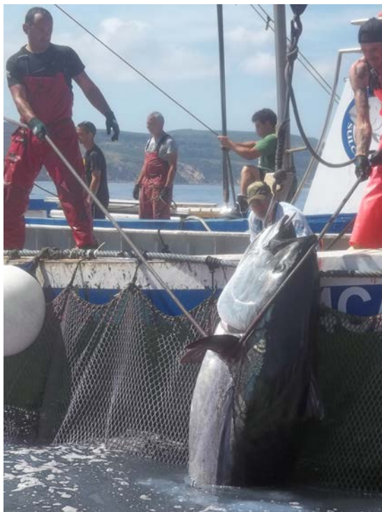
Figure 2. Bluefin tuna catching and bringing on board of ice provided boats in the traditional static tuna traps of Porto Paglia, in the south-western coast of Sardinia (Sulcis-Iglesiente).

As reported in the necessarily extensive introduction, Hg contamination in fish products, and in large pelagic predatory fish in particular, is a remarkable food safety issue that affects fishery, such as the last static tuna traps still in active in the south-western coast of Sardinia (Sulcis-Iglesiente). In the traditional static tuna traps (Figure 2) of Porto Paglia, Capo Altano and Carloforte, the catching of Thunnus thynnus still represents both a support to local fish industry (Figures 3 and 4) and an undisputable traditional activity of local population.