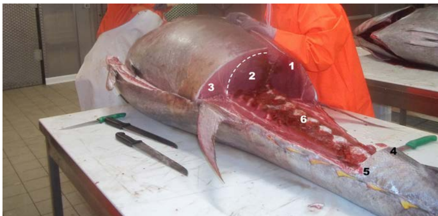
Figure 4. Intermediate processing step - at Tonnare Sulcitane's establishment - of bluefin tuna after removal of "codelle" or tails: 4) "nera" or black and 5) "bianca" or white on left fish side. In the transversal section, the far end of the following commercial cuts can be distinguished: 1) the "schienale" or upper loin; 2) the "bòdano" or lower loin, and 3) the "ventresca" or belly flap. In the deepest part alongside the fishbone, 6) the "buzzonaglia" or dark meat.

Therefore, also in the present case there is potential for longitudinal variation causing discrepancies among different muscular cuts that European legislation managed by enforcing that the incremental sample must consist of the middle part of the fish. However, also a potential for transversal