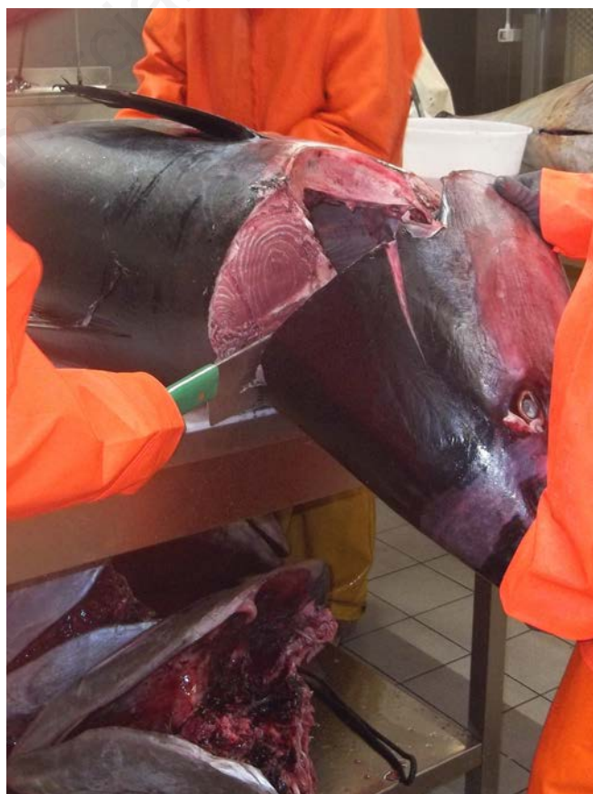
Figure 3. Initial processing step - always at Tonnare Sulcitane's establishment (in Portoscuso, South-West of Sardinia) - of bluefin tuna already bled (and having gill arches removed) and eviscerated.