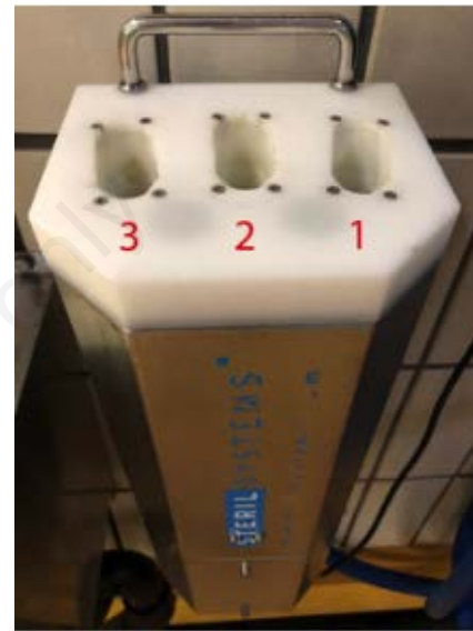
Figure 1. ME3-S device (Sterilsystems GmbH, Mauterndorf, Austria) for UV-C decontamination of knives with the different blade insertion sites (positions 1 to 3).

When comparing TVC reductions obtained by UV-C treatment on knives from the wet and clean area of a slaughterhouse, reductions were generally comparable and differed on average by less than 0.2 log CFU cm -2 (despite the significant differences in the initial contamination, P<0.05). With