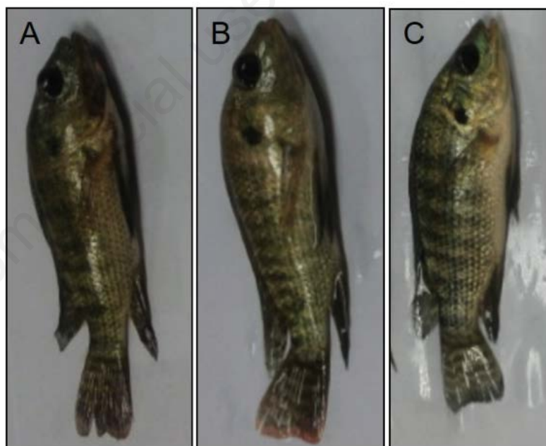
Figure 2. Morphological features of Nile tilapia fed on earthworm reared on soil sludge. The figure shows Nile tilapia fed on earthworm reared on soil treated with various concentrations of sewage sludge. A) Showing the control Nile tilapia that was grown on control soil containing no sewage sludge, B) is a representative of Nile tilapia that were fed on earthworm reared on soil treated with 25% sewage sludge, and C) Nile tilapia fed with earthworm reared on 100% sewage sludge.