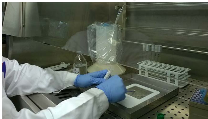
Figure 1. Surface sampling according to ISO 18593:2004 (ISO, 2004).

CFU, colony forming unit. Values are expressed as means of five replicates for each concentration considered in the trial.