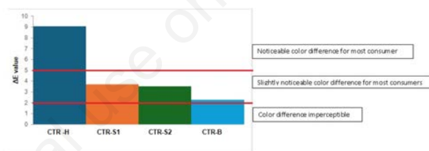
Figure 2. Global color difference within each treatment comparing 10 days of storage to 0 days of storage. CTR-H, burger with no addition; CTR-S1, burger with an addition of 0.0156 g/g of Stymon 50 W; CTR-S2, burger with an addition of 0.03125 g/g of Stymon 50 W; CTR-B, burger with an addition of 0.15 % of beetroot extract; \Delta E , color difference - \Delta E = [(L^* - L^*_0)^2 + (a^* - a^*_0)^2 + (b^* - b^*_0)^2]^{0.5}

4) was also influenced by phenolic compounds, confirming the findings of other studies that showed that off-flavors and off-odors of meat preparation were caused by aldehydes produced during lipid oxidation. The increased presence of polyphenols in ground meat most likely affects lipid stability during product storage, resulting in delayed development of off-odor and off-flavor (Descalzo et al. , 2008). Such a delay in off-flavor development was not found in the sample with beetroot addition. This could be explained by the fact that betalains do not inhibit lipid oxidation, as shown by Jin et al. (2014). Indeed, the authors reported a significant increase in redness and sensory acceptability of color in pork sausages produced with beetroot powder extract, but no significant effect in terms of lipid oxidation. In terms of overall palatability, panelists perceived a slightly bitter taste in the CTR-S2 sample, whereas the bitter taste was almost imperceptible in the CTR-S1 sample, resulting in the most preferred sample at the end of storage. The bitter taste did not negatively affect the CTR-S2 sample at the end of storage compared to CTR-H and CTR-B, probably due to the inhibition of lipid oxidation by the added polyphenols (Roila et al. , 2022).