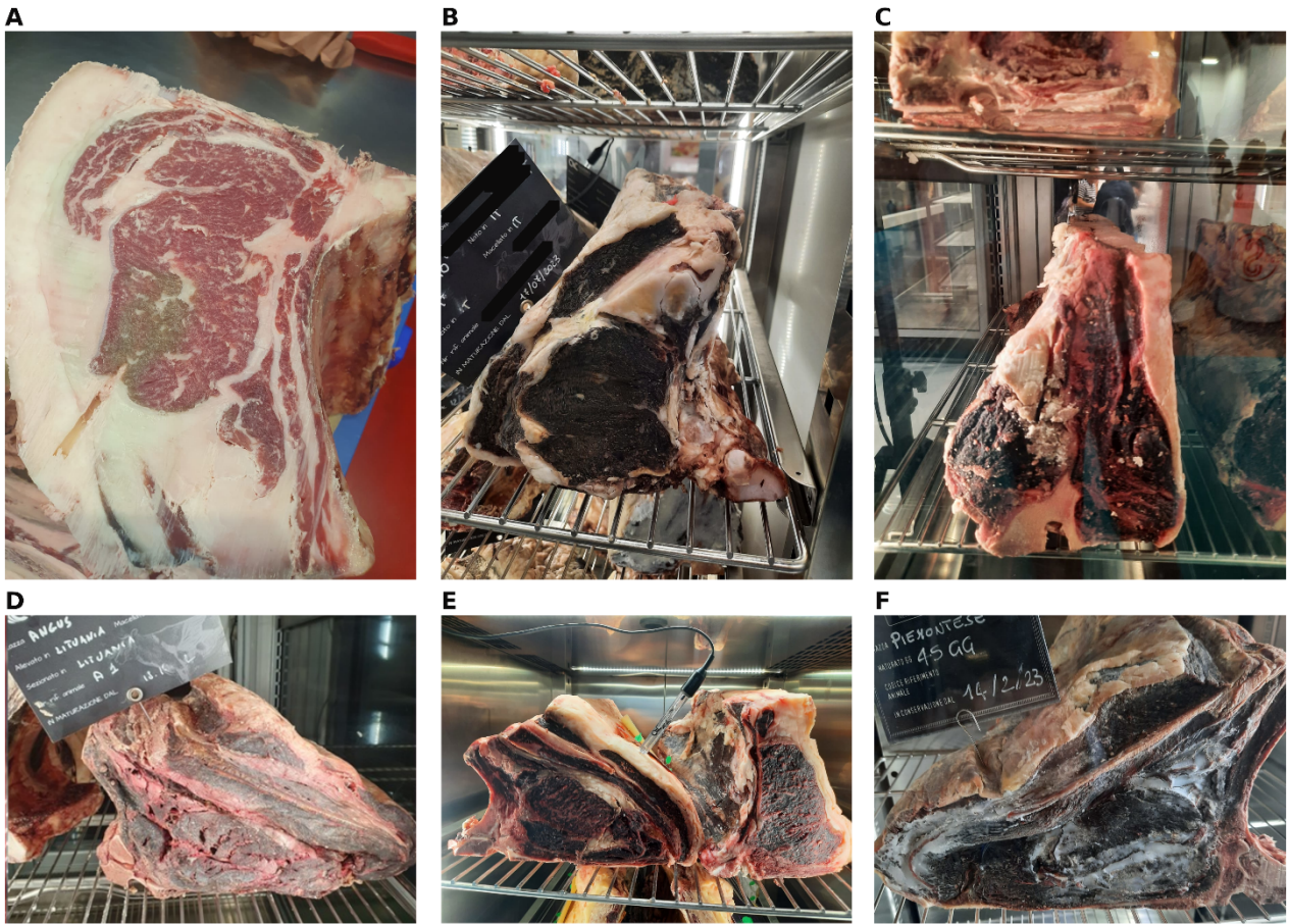
Figure 3. A) Meat with deep spoilage; before trimming the meat showed a fessuration with a humid apperance; after cutting meat showed areas of discoloration (green) with off odor that increased after cooking; B) meat with regular surface: a uniform crust can be observed; C) meat with regular surface, but with fessurations on the surface; D) meat with irregular surface: the crust is irregular and several fessuration can be observed; E) meat with regular surface and with regular and homogeneous crust; F) dry-aged meat with beef tallow applied on fessurations.