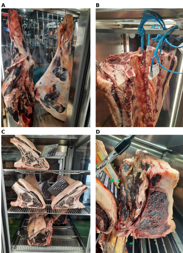
Figure 2. A,B) Beef hanging from the bones when is not directly positioned on the shelves; C) correct positioning of ribs: a distance of usually 3 cm is considered the minimum among ribs; D) ribs are too close to one another and do not allow correct circulation of airflow.