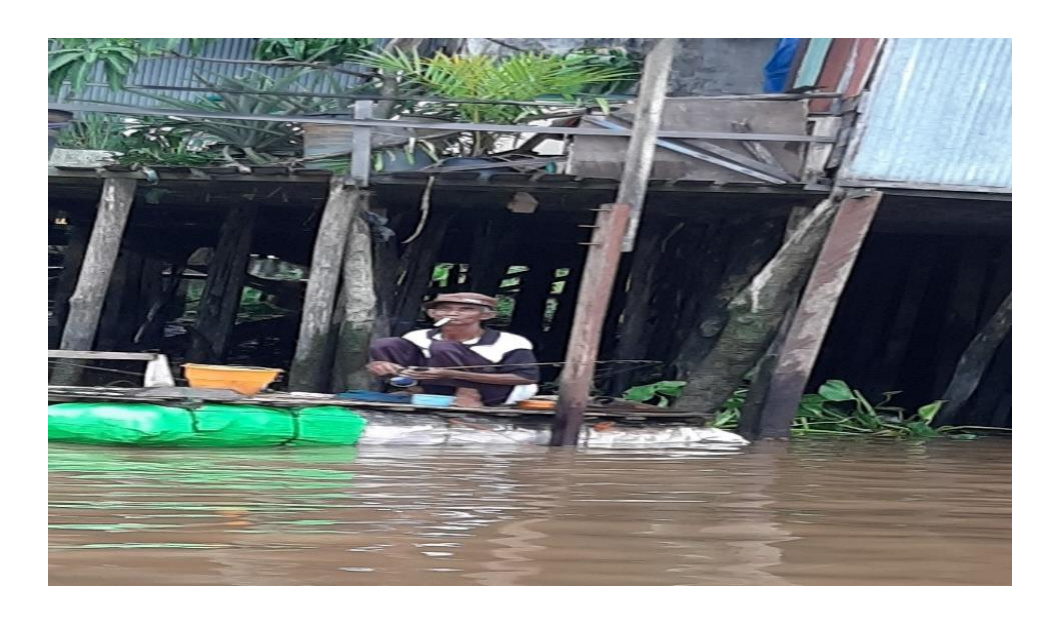
Figure 3. Fishing on the riverside (photos by Herawati, 2020)