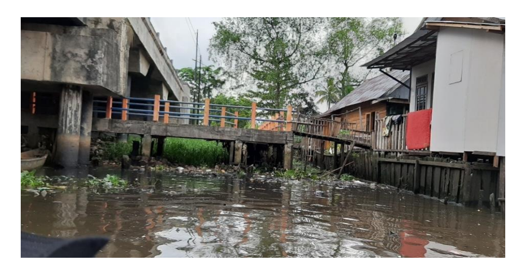
Figure 2. The physical condition of the River is plastics and polluted from household under the houses