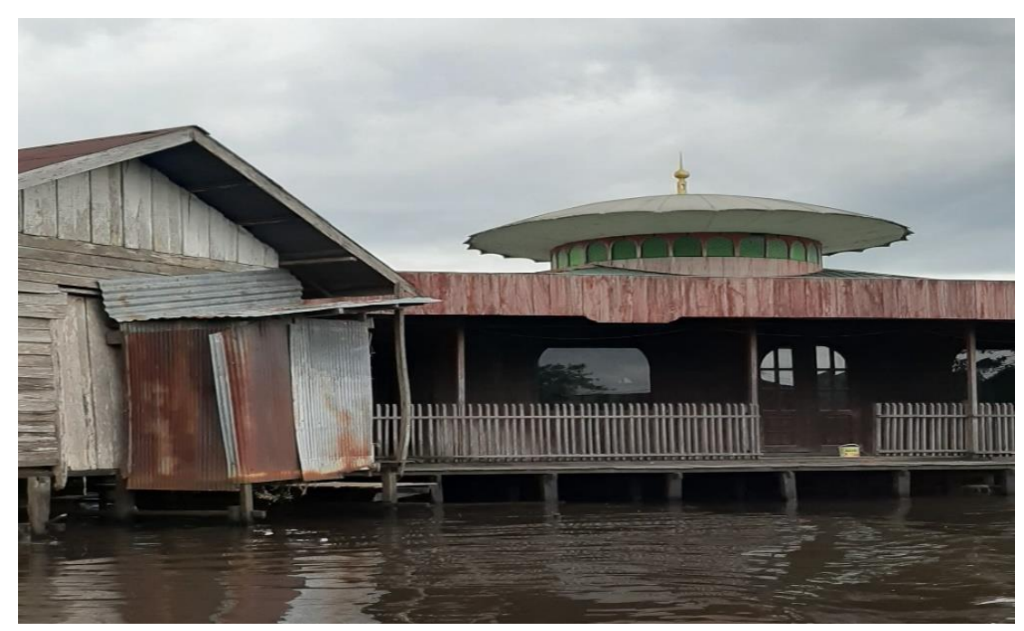
Figure 5. Mosques on the riverside