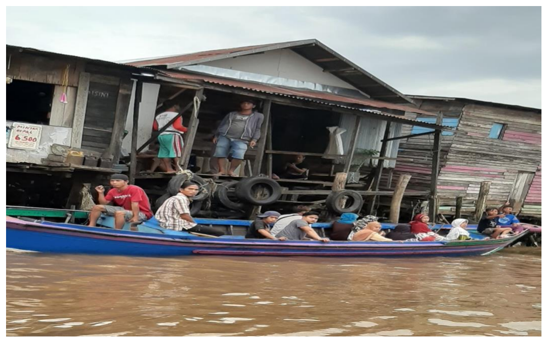
Figure 7. River as transportation stripe