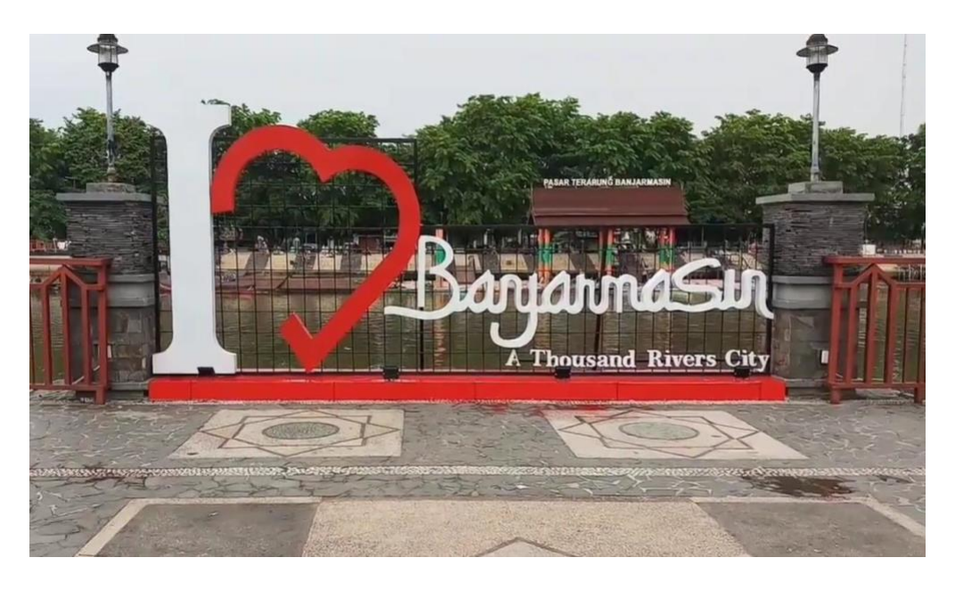
Figure 1. Banjarmasin is the city of a thousand rivers