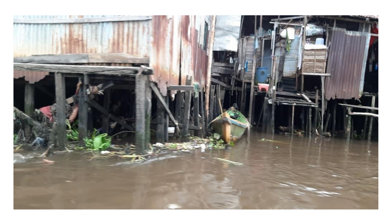
Figure 8. Resident's Boat