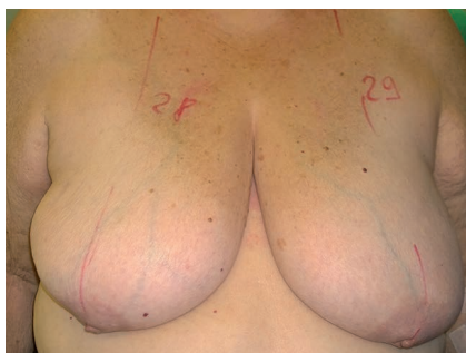
Figure 2. Ductal carcinoma in the lateral quadrants of the right breast infiltrating the dermis (frontal view).