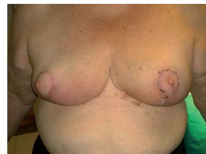
Figure 4. Controlateral inferior pedicle breast reduction: final result.