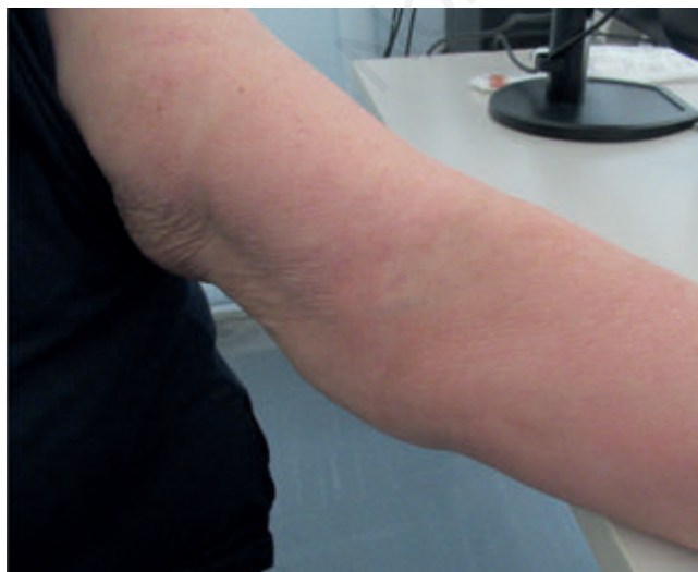
Figure 1. Photograph of patient's left upper limb: erythema and swelling of the whole arm are present.

injection showed multiple lymphadenopathy in the left axillary area and ruled out pathological involvement of other organs. An excisional biopsy of the axillary lymphadenopathy was performed for histo-