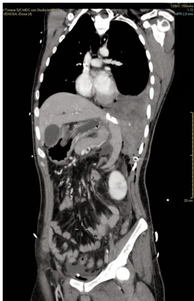
Figure 3. Contrast-enhanced computed tomography, coronal plane: imaging after surgical repair of the hernia.