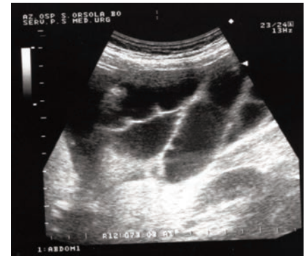
Figure 2. Abdominal ultrasonography scan of the central abdomen showing dilated fluid-filled small bowel loops with thickened wall.