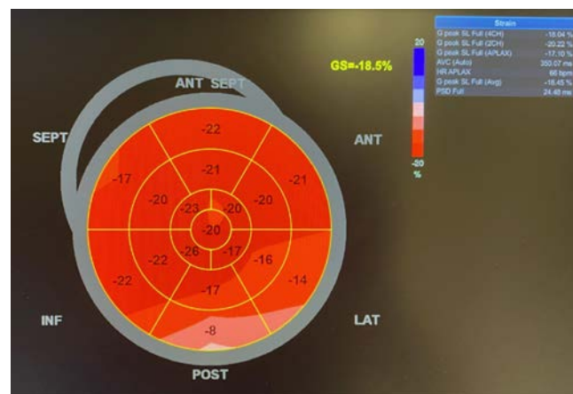
Figure 2. Cardiac magnetic resonance imaging on the third day showing extensive myocarditis involving the lateral and inferior walls.

The therapeutic approach to myocarditis hinges upon several factors, encompassing the acuteness, severity, clinical manifestation, and underlying causative factors. 2,3 Supportive care remains a cornerstone, while guidelines for heart failure management are applicable when dealing with cases featuring reduced LVEF. 2 The utilization of \beta -blockers or angiotensin-converting enzyme inhibitors to mitigate inflammation, counteract adverse remodel-