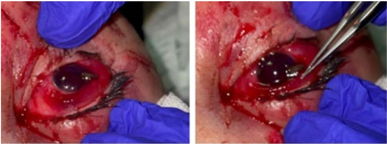
Figure 1. 1 cm long tear on the right upper eyelid, and the conjunctiva was edematous and hemorrhagic.