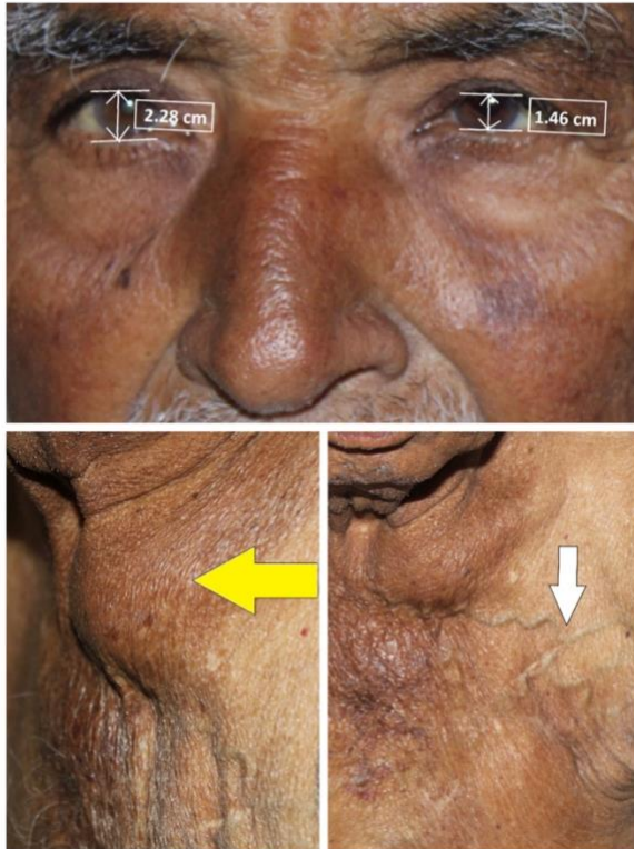
Figure 1. The image shows the ptosis of the left eye of the patient. Yellow arrow showing swelling over medial end of the clavicle and a white arrow showing dilated veins over the left shoulder.

The publisher is not responsible for the content or functionality of any supporting information supplied by the authors. Any queries should be directed to the corresponding author for the article. All claims expressed in this article are solely those of the authors and do not necessarily represent those of their affiliated organizations, or those of the publisher, the editors and the reviewers. Any product that may be evaluated in this article or claim that may be made by its manufacturer is not guaranteed or endorsed by the publisher.