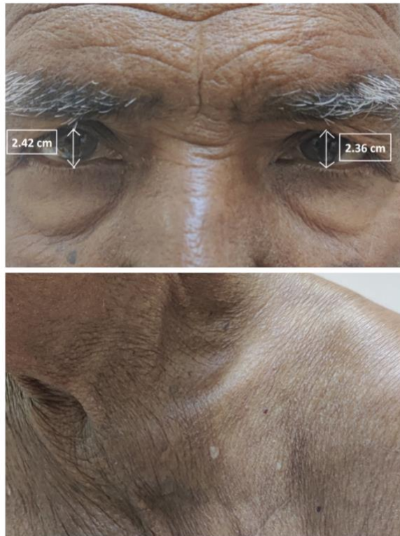
Figure 3. The image shows the complete resolution of ptosis and dilated veins after eight weeks.

The publisher is not responsible for the content or functionality of any supporting information supplied by the authors. Any queries should be directed to the corresponding author for the article. All claims expressed in this article are solely those of the authors and do not necessarily represent those of their affiliated organizations, or those of the publisher, the editors and the reviewers. Any product that may be evaluated in this article or claim that may be made by its manufacturer is not guaranteed or endorsed by the publisher.