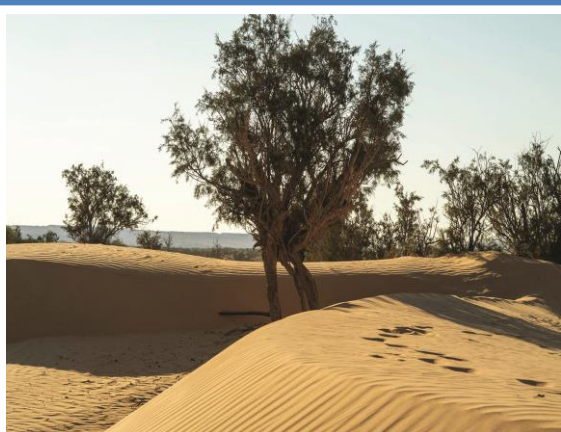
Fig 4. Tamarix aphylla plantation, Negev, Israel.