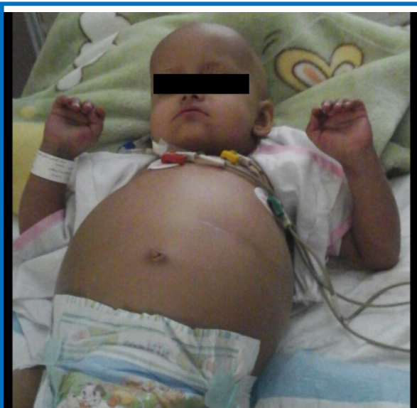
Fig 2. Ascitic distention of patient's abdomen

These new diagnostic guidelines provide the criteria for early diagnosis and treatment of the disease. When clinical criteria are not sufficient to diagnose a VOD, but the suspicion is high, a liver biopsy may be used to confirm or not the diagnosis. 6 In patients over one-month of age Defibrotide has been approved to treat this condition in the United States and the European Union. 1 Defibrotide is a polydeoxyribonucleotide that has anti-inflammatory effects that protects endothelial cells, thus helping to restore thrombo-fibrinolytic balance. 7 Therefore, the aim of this report was to present in a