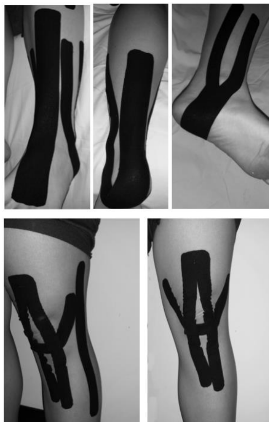
Fig 1. Neuromuscular taping application adopted for knee and ankle taping in the group of basketball players.

Kinematic data were recorded with the a SMART-D optoelectronic system (BTS Bioengineering, Milan, Italy), which consists of eight infrared video cameras.