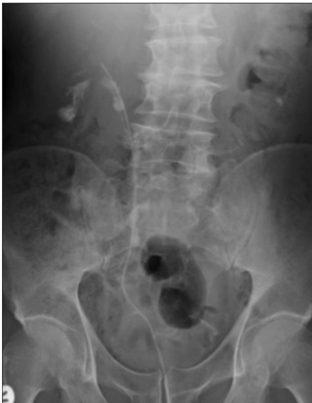
Figure 2. X ray KUB - Fine fragmentation and removal of the encrusted stent with ureteric catheter in place.