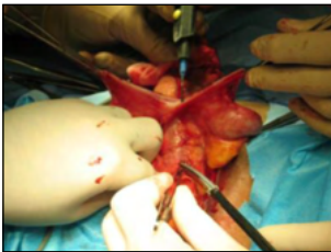
Figure 3. Penile degloving.