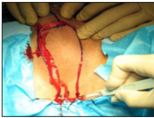
Figure 1. Inverted U-shape incision on the posterior aspect of the scrotum, centrally prolonged on the penis.