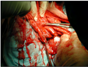
Figure 2. Isolation of the testis and spermatic cord, before the ligature at the external inguinal ring.