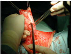
Figure 4. Asportation of corpora cavernosa after isolation of neurovascular bundle.