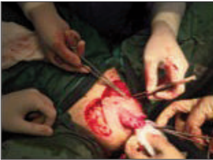
Figure 3. Surgical technique.

throscopy. The patient's penis was reconstructed with partial thickness skin graft. A dermatome was employed to achieve a graft, which was placed for immediate reconstruction after the oncologic resection (Figure 2). A foley catheter was placed for 7 days. The nodules in pubis were resected with macroscopic clearance as well. The large skin defect that was created as a consequence of this resection forced us to translocate the trunk of the penis in a more convenient location that could be covered by the scrotum (Figure 3). According to the pathology report, in gross inspection a tumor of 7.5 x 4 cm in major dimension was noted involving the foreskin and glans of penis. In addition, multiple satellite nodules were noted in pubis. Histologically, the tumor was corresponded to a squamous cell carcinoma, exhibiting a solid pattern and minimal keratin production. In a small relatively area, tumor showed "basaloid features" with a solid pattern and peripheral palisading of nuclei, while tumor cells had small size and dark nuclei. Chromogranin and synaptophysin immunohistochemical stains were negative, so there was no neuroendocrine differentiation (Figures 4, 5). The patient's post-operative healing was