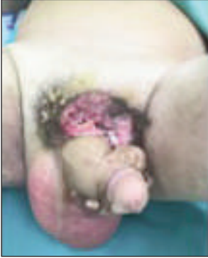
Figure 1. Penile lesion.