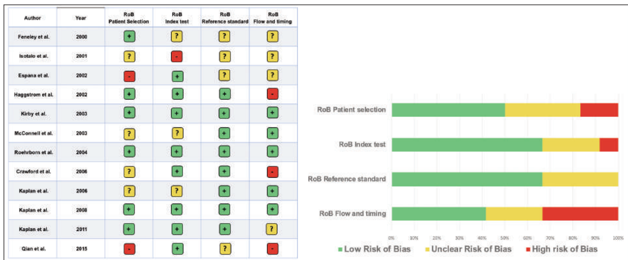
Figure 2. PRISMA flow diagram.

Of the 12 studies included in our review, 5 were conducted in Europe, 4 in USA, 1 in China, 1 was globally dis-