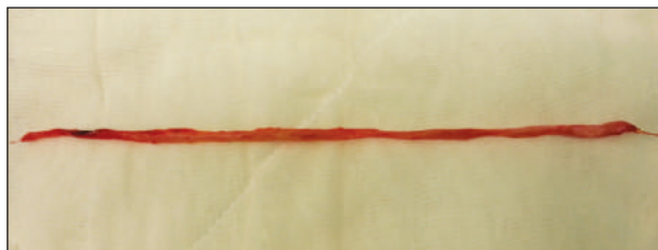
Figure 1. Avulsed ureter from both ends after releasing it from URS.

Distal ureteral avulsion occurred during the attempt to reach the distal ureteral stone in one case (diagnosis was made after suspicion of ureteral injury with retrograde ureterography) or when the URS was pulled back with force after the stone was caught with forceps in the other case. Approximately 3 cm of the avulsed ureter exited from the ureteral orifice coating the stone and forceps. The other avulsed case Repair procedures were performed with an open surgical approach during the same URS session. The bladder was mobilized by freeing its peritoneal attachments. The damaged ureter was identified as it crossed the iliac vessels, mobilized, and divided just above the avulsed segment. The ipsilateral bladder dome was fixed to the psoas muscle, and ureteroneocystostomy (UNC) was performed. A double-J stent was used in both cases.