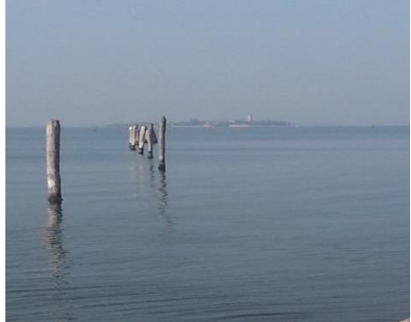
La laguna di Venezia, Ospedale San Camillo