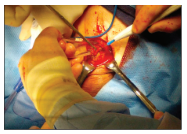
Figure 4. Dissection of the mass from he connections between cylinders and the pump.