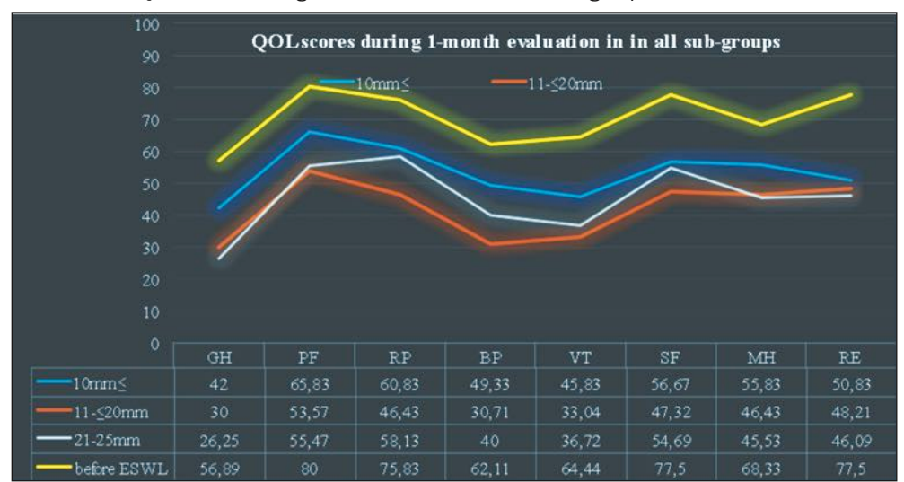
Figure 1a. Evaluation of QoL scores during 1-month evaluation in all sub-groups.

Mann Whitney U Test, p < 0.05, GH, general health. PF, physical functioning. RP, role-physical. BP, bodily pain. VT, vitality. SF, social functioning. MH, mental health. RE, role-emotional.